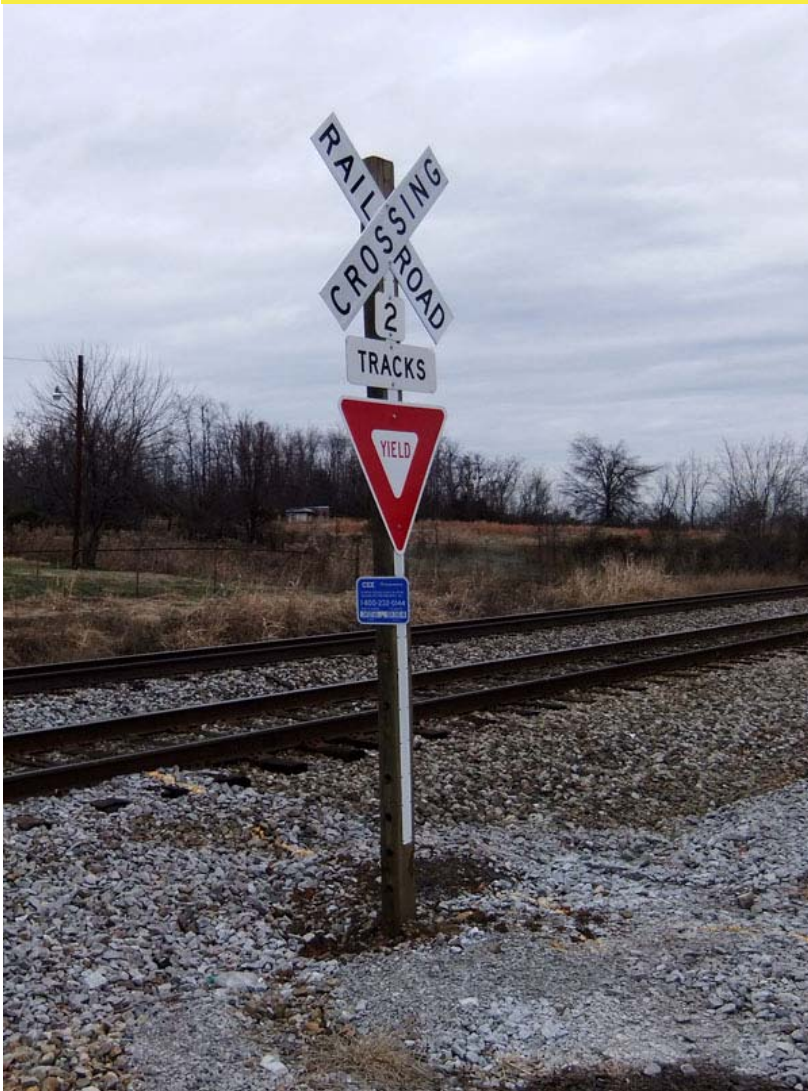
Left: CSX is putting new crossing signage at the non-signalized grade crossings. The new signs have reflective coating on all parts - the crossbuck, the 'yield' sign (new) and on both sides of the support post. Submitted by Chuck Hinrichs.

Right: From Railpictures.net - Hot Rail After a freak snow storm the day before, the bolts of a joint bar seen on the left have broken due to rail contraction from the cold weather. The next day, an alert track maintainer has found the broken bolts and goes about fixing the break by heating up the rail thus allowing it to expand back into place so that new bolts can then be installed. After a quick fix, this CSX mainline is open for track speed again. Submitted by Chris Dees.